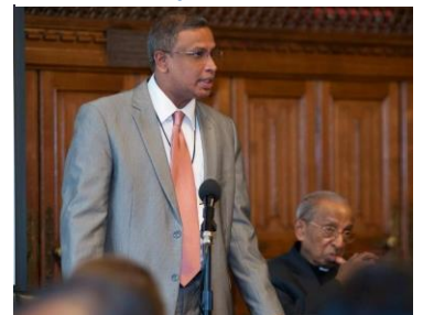
Hon. MA Sumanthiran MP - Tamil National Alliance