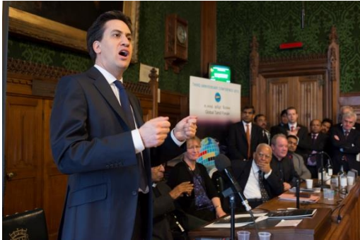
Rt. Hon Ed Miliband MP, Leader of the Labour Party, addressing the Conference

Rt. Hon Baroness Warsi , delivered her address in the absence of the British Foreign Secretary, Rt Hon William Hague MP , who was on overseas business. She called for the full implementation of the constructive recommendations of Sri Lanka's Lessons Learnt and Reconciliation Commission and reaffirmed the Government's support for " credible, thorough and independent " into human rights violations at the end of the armed conflict on the island in 2009.