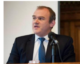
Rt. Hon Ed Davey MP , Secretary of State – Energy and Climate Change