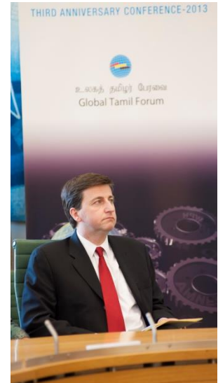
Rt. Hon Douglas Alexander MP , Shadow Foreign Secretary