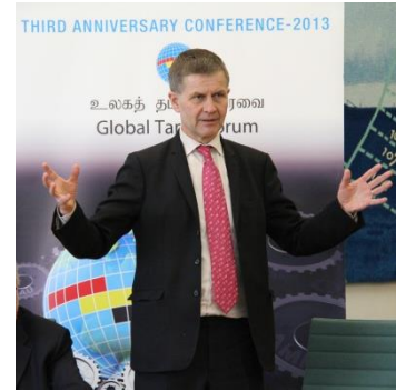
Hon. Erik Solheim, Former Norwegian Government Minister and lead negotiator in Sri Lankan Peace Process