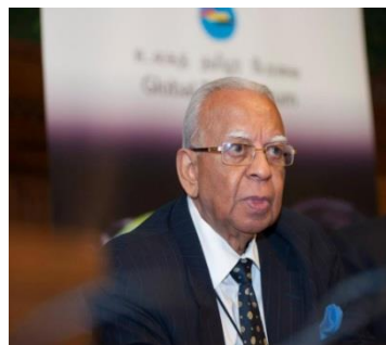
Hon. R. Sampanthan MP, Leader of the Tamil National Alliance