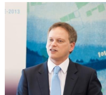
Rt. Hon Grant Shapps MP, Conservative Party Chairman