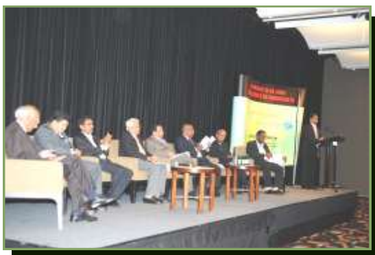
Panel discussion with overseas speakers