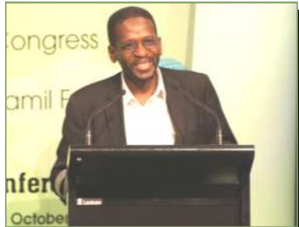
Mr. Sisa Njikelana - Member of Parliament (African National Congress), Republic of South Africa