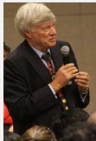
Geoffrey Robertson QC at the conference

Also present was eminent lawyer Geoffrey Robertson QC , a counsel in many landmark cases in constitutional, criminal and media law in the courts of Britain and the commonwealth and the European Court of Human Rights.