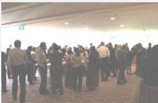
Morning Tea being served