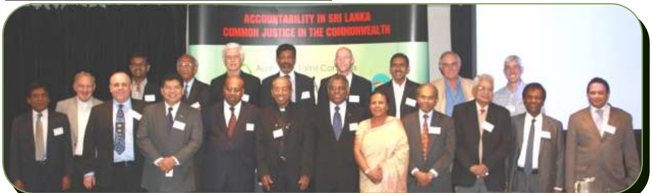
Speakers and distinguished guests at the morning session.